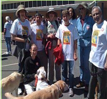
Crop Walk April 3rd, 2011